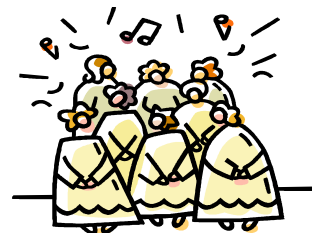
St. Mary' Adult Choir